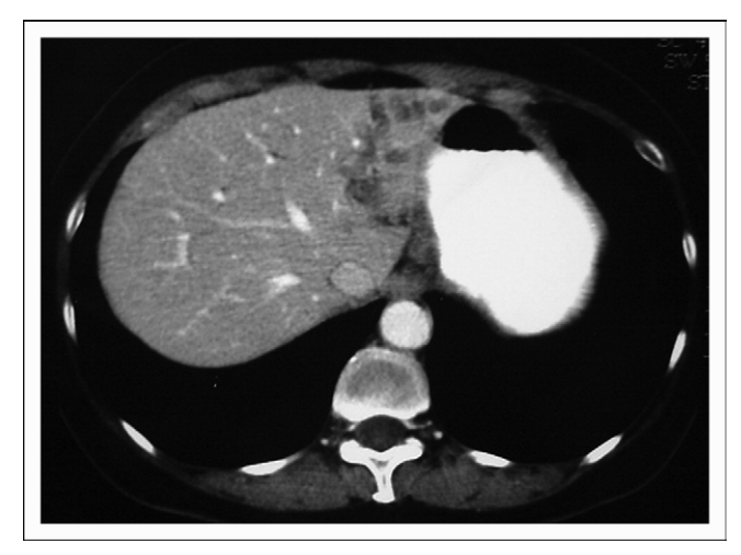
Fig. 1. Computed tomography scan showing left lobe of the liver atrophy with dilated bile ducts

Indications for liver resection in this series were: parenchymal atrophy in 17 patients, intrahepatic biliary stenosis in 5, and unilobar liver fibrosis in 5. Two patients were