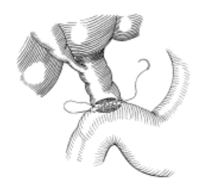
FIG. 4. After opening the duodenum, its wall is included in the continuous suture.

FIG. 3. The duodenum is opened with scissors.