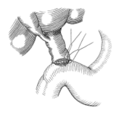
FIG. 5. The choledochoduodenostomy is completed with interrupted stitches.

FIG. 4. After opening the duodenum, its wall is included in the continuous suture.